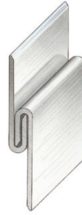
GA WP2 5.2mm wall to panel fixing distance