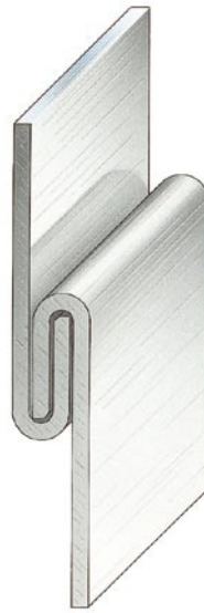
GA WP1 8.7mm wall to panel fixing distance